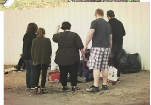
(Serving the Homeless On Lancaster Ave).